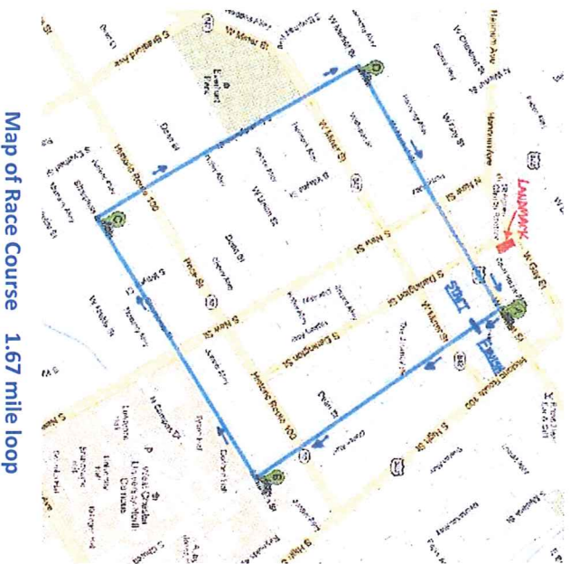
Map of Race Course 1.67 mile loop West Chester, PA